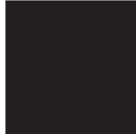
Black - BLK