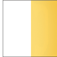
Gold and White - GWI